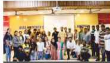
SATURDAY DHAMALA- A Movie Marathon