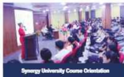
Synergy University Course Orientation